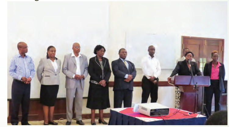
Madam Chepkonga introduces the ACU committee