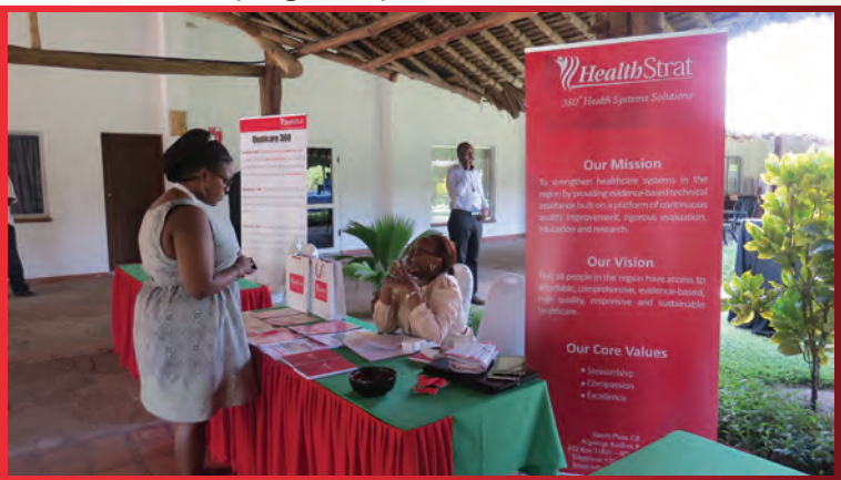
Health Strat stand at the KEPSA 1st annual CEC conference