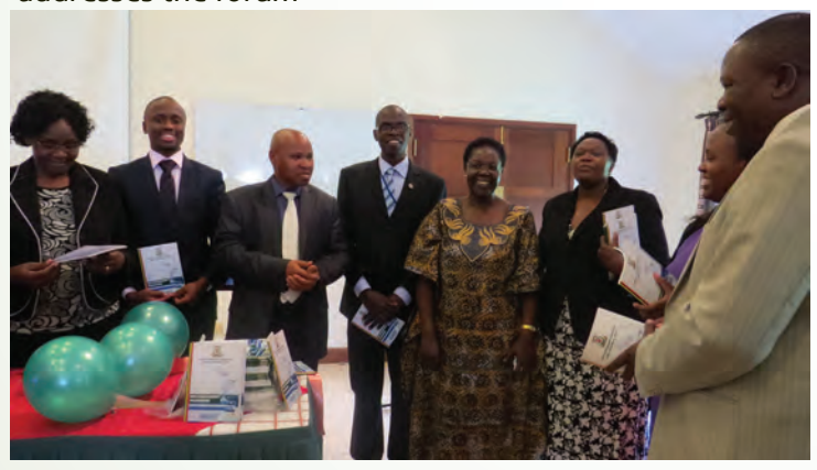
Stakeholders were presented each with a copy of the published framework document